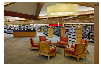
The current media area is scheduled to be transformed.

This spring the inside and outside of the Library building will get some much-needed attention. Inside, there are plans to move around some collections. Outside, the roof will undergo necessary repairs. We know that these changes will bring noise and some questions, but the result will be a refreshing change to the look of the Library. Stay tuned to this newsletter, our eNewsletter and social media accounts for more information as work progresses.