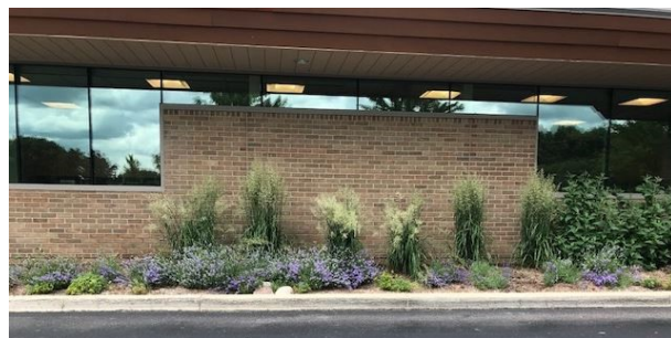
Book Drop Drive-up Lane Landscaping

The Friends of the Bloomfield Township Public Library continue to help the Library elevate its service from good to great with their generous donations. The Friends total gift for the 2016/2017 fiscal year was $74,239.34. Friends gift funding has helped accomplish projects that enhance the Library's beauty as well as its sense of place in time. From funding the historic photo project to improving library gardens to supporting programs that educate and entertain, we get by with a LOT of help from our Friends. Thank you, Friends, for all your hard work, generosity, and dedication to making Bloomfield Township Public Library the place to discover!