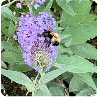
Bees or hummingbirds near flower