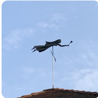
Weather vane turning in the wind