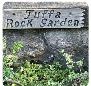
Tuffa Rock Garden