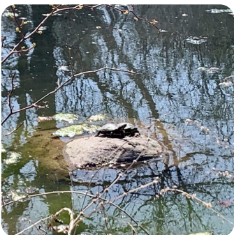
Turtles, fish, or ducks in pond