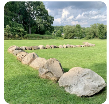
Rocks on the grass