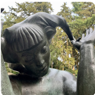
Sculpted figure by Greek Theatre