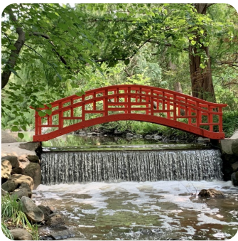
Bridge in Japanese Garden