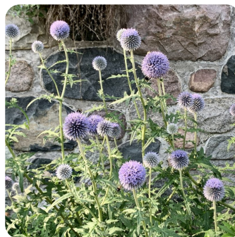
Flowers in sunken garden