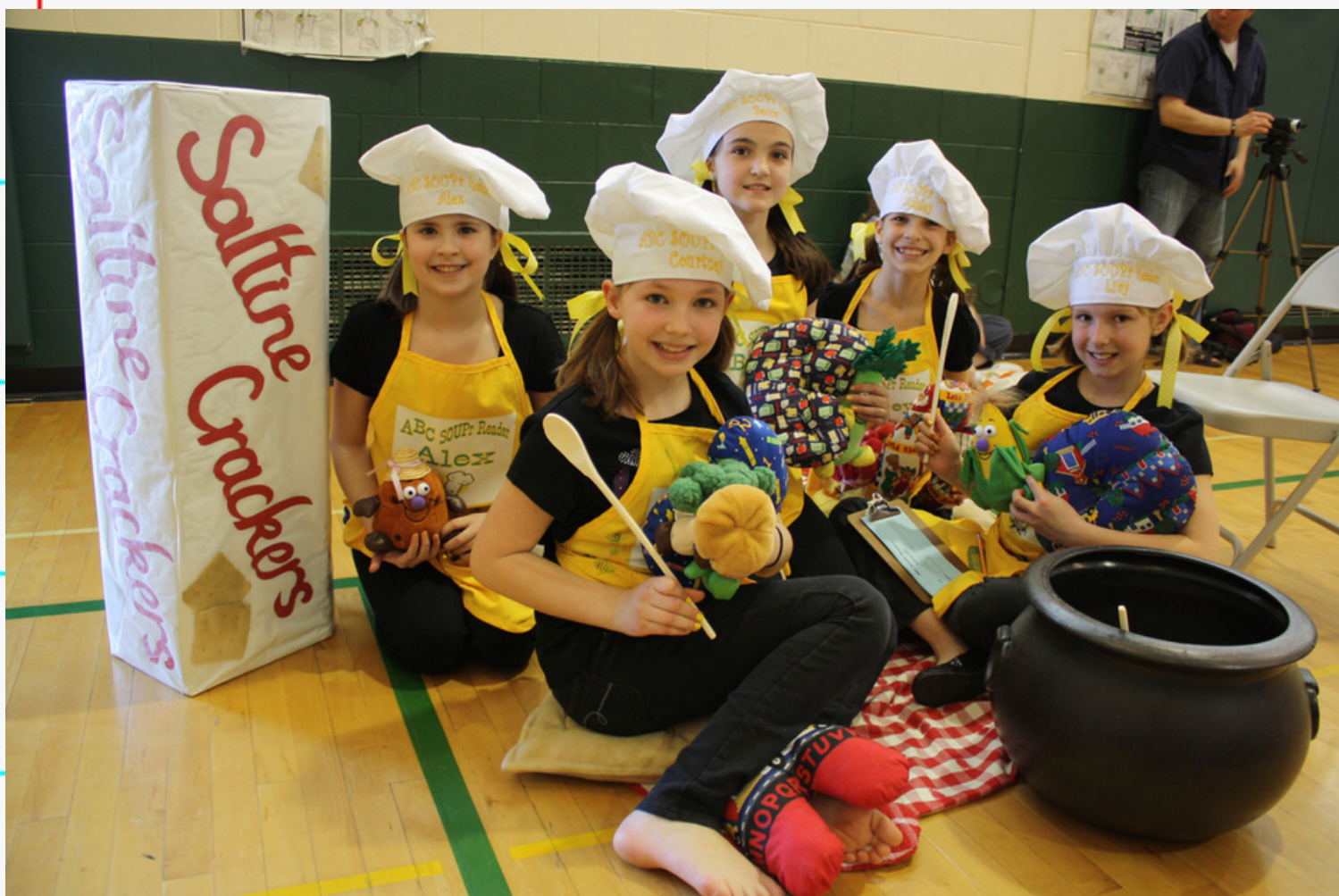
ABC Soup Stars