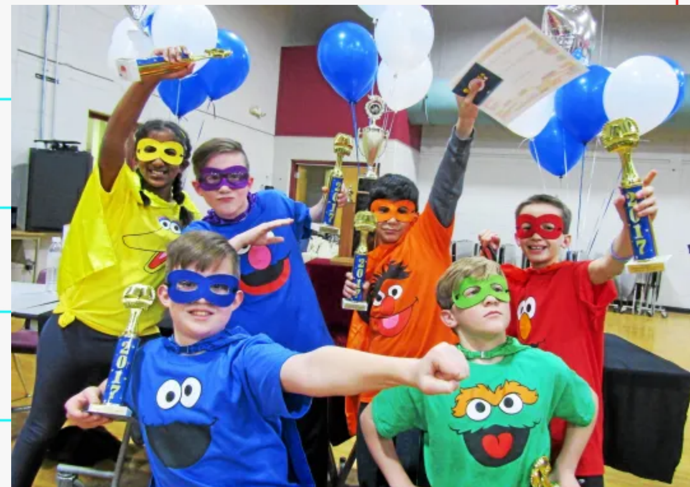
Sesame Street Readers