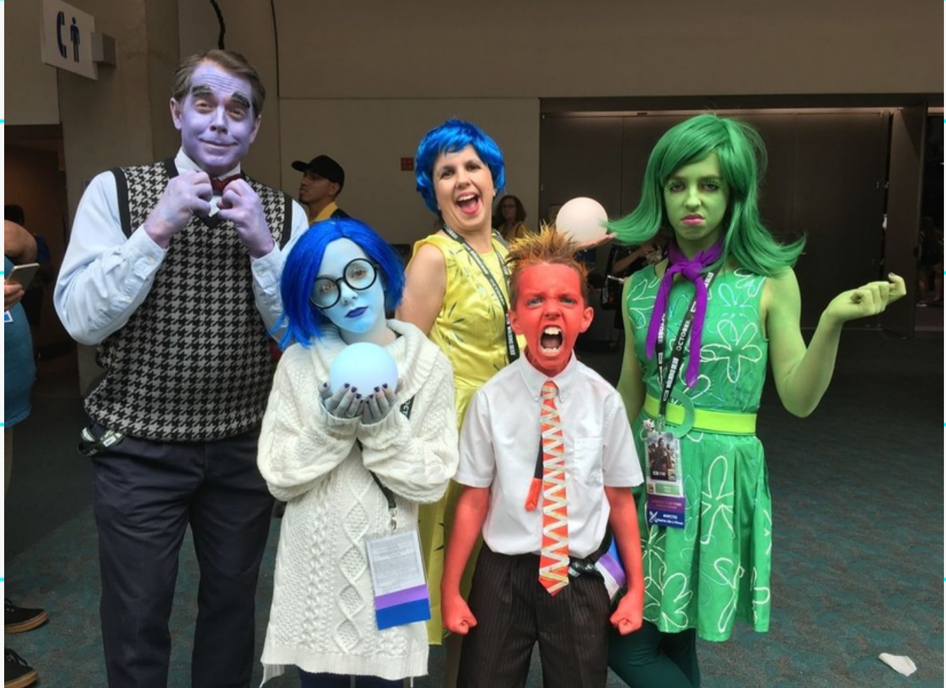
Inside Out Book Crew